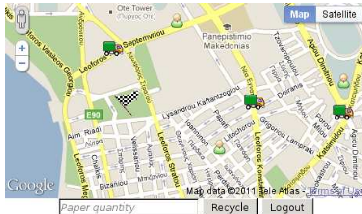
Fig. 2. Web Interface of EcoTruck Application

In [10] authors employ multi-agent simulation coupled with a GIS to assist decision making in solid waste collection in urban areas. Although the approach concerned truck routing, it was in a completely different context than the one described in the present paper: the former aimed at validating alternative scenarios by multi-agent modelling in the waste collection process, while EcoTruck aims at dynamically creating truck paths based on real time user requests.